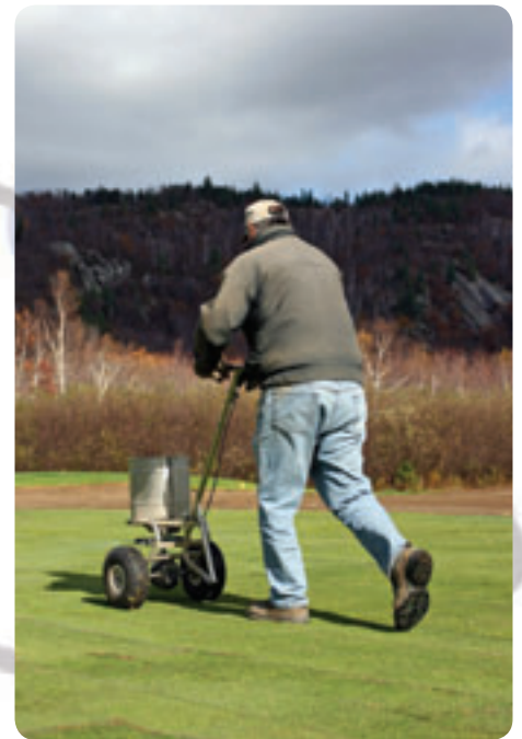
The soaring price of natural gas directly affects the market cost of nitrogen-containing fertilizers.

Global demand for fertilizer has also been on a steady rise. Historically, the United States consumed all of the fertilizer produced domestically. However, as agricultural lands diminish, U.S. Currency