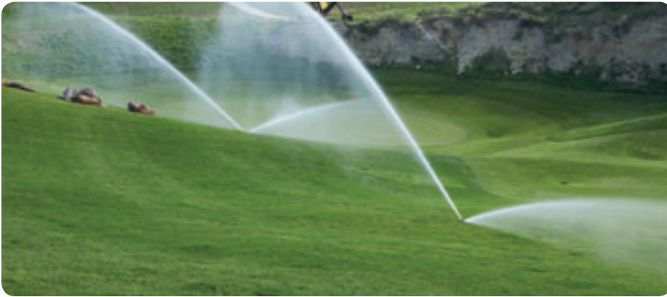
Hunter's G990 heads offer distribution uniformity and provide a full range of coverage to assist in seed germination.