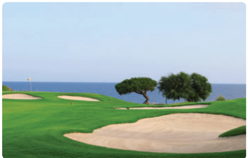
Golf courses across the country use SandMat to solve their bunker dilemmas.

Anyone who is constructing, rebuilding or having problems with their bunkers, should consider SandMat. There is not a better bunker solution on the market. 💧